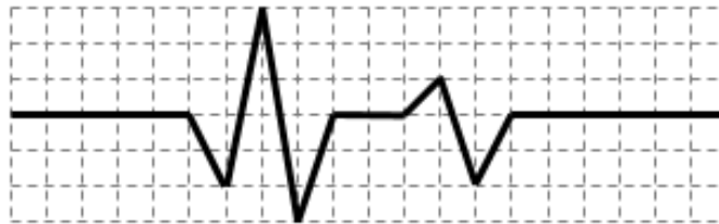
The cardiogram of a healthy patient.

The technique used by Dr. Zoidberg to adulterate a cardiogram consists of removing exactly K points from its polyline, where K depends on the seriousness of the patient. Of course, there could be several ways to do that, but the joke will be the best (in Zoidberg's opinion!) if the resulting plot is as short as possible in the sense that it becomes a good approximation to a straight line, that is, if it makes the patient believe he or she is close to death. To avoid suspicion, Dr. Zoidberg does not remove neither the first point nor the last point from the polyline.