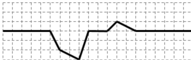
The first cardiogram removing some K = 2 points.